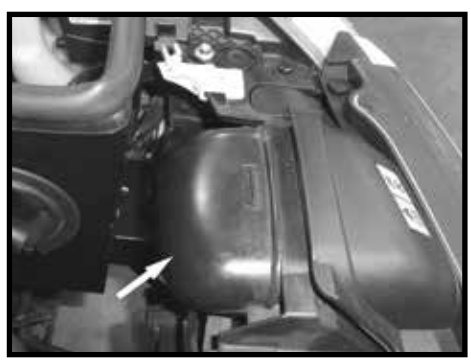
Step 16 Install the stock fresh air scoop into the scoop of the heat shield and the reattach to the factory connection on the core support.