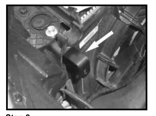
Step 8 Install the heat shield mounting bracket provided onto the bottom of the bolt installed in previous step along with the spacer provided. Note: The spacer will be between the bracket and the core support.