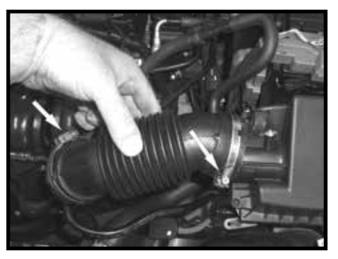
Step 3 Loosen the 2 hose clamps that secure the factory intake tube and then remove the intake tube from the vehicle.

Release the red locking tab and then disconnect the mass air sensor electrical connection. When equipped with EVAP, disconnect the EVAP vent line from the factory intake tube as shown.