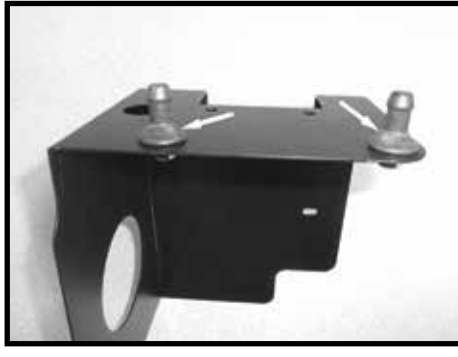
Step 9 Install the 2 provided heat shield mounting studs to the bottom of the heat shield as shown using the provided hardware.