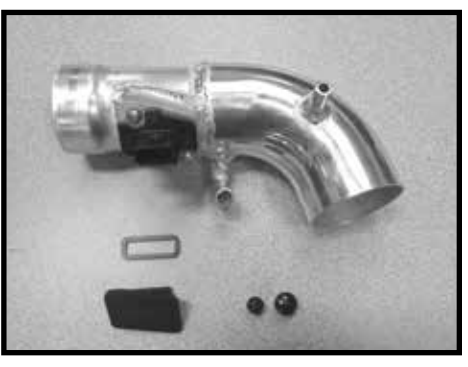
Step 18 On vehicles that are equipped with a mass air sensor install the sensor into the Spectre intake tube using the supplied hardware. On all other vehicles, install the provided gasket onto the block off plate and install the block off plate into the Spectre intake tube using the provided hardware.

Remove the 2 bolts securing the mass air sensor to the factory air box and then remove the sensor from the air box. Note: Some vehicles may not be equipped with a mass air sensor.