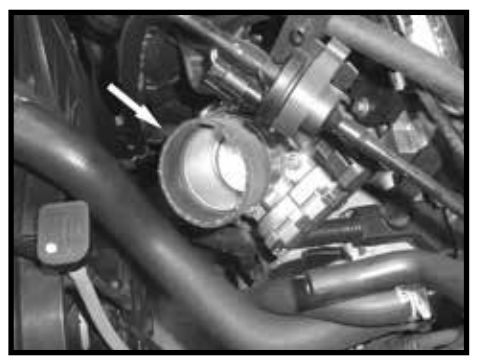
Step 14 Install the provided coupler onto the throttle body and secure with provided hose clamp.

Step 13 Install the heat shield assembly into the vehicle so that the mounting studs are inserted into the factory mounting grommets, and the secure to the mounting bracket installed during step #8 using the provided hardware.