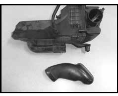
Step 15 Disconnect the fresh air scoop from the stock air box.