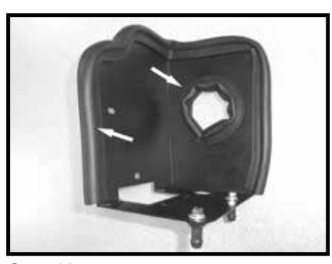
Step 11 Install the 10" section of edge trim into the hole of the heatshield as shown. Install the 27" section around the edge of the heat shield as shown.