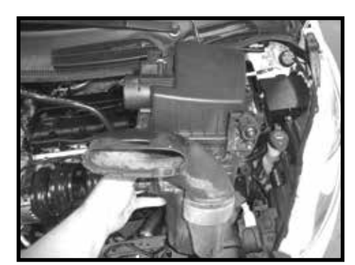
Step 5 Lift up the air box assembly to release it from the mounting grommets and then remove it from the vehicle.

Step 4 Disconnect the crankcase vent hose from the from the valve cover. Then disconnect the fresh air intake scoop from the core support.