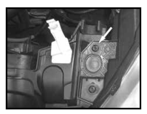
Step 6 Remove the air box mounting bracket bolt shown.